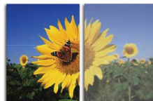
With SmartImage Without SmartImage

SmartImage is an exclusive leading edge Philips technology that analyses the content displayed on your screen and optimises your display performance. This user-friendly interface allows you to select various modes, like Office, Photo, Movie, Game, Economy etc., to fit the application in use. Based on the selection, SmartImage dynamically optimises the contrast, colour saturation and sharpness of images and videos for ultimate display performance. The Economy mode option offers you major power savings. All in real time at the touch of a single button!