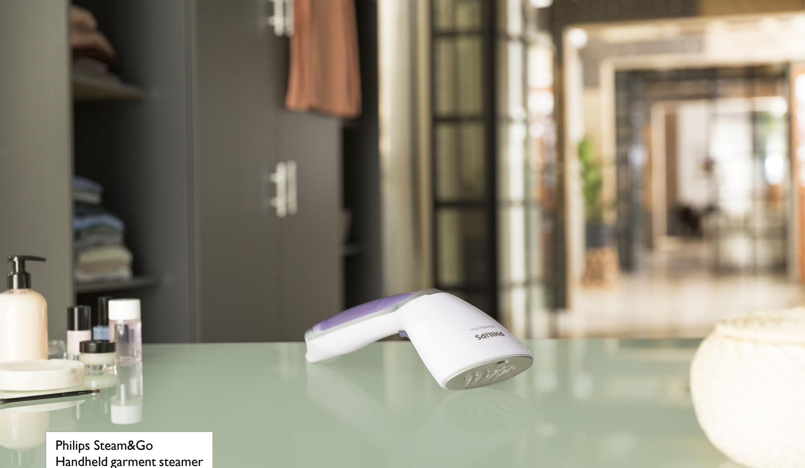
Philips Steam&Go Handheld garment steamer