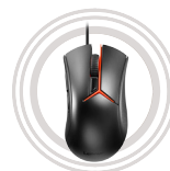
Y Gaming Optical Mouse