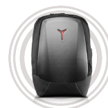
Y Gaming Armored Backpack