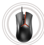
Y Gaming Optical Mouse