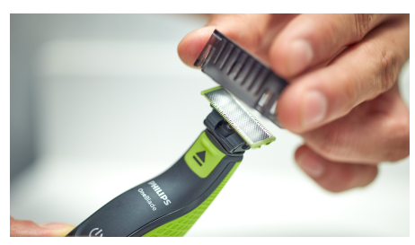
Attach one of the click-on combs to get the even stubble length you want.