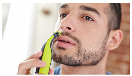
Create precise edges with the dual-sided blade. You can shave in either direction to get great visibility and see every hair that you're

cutting. It stays comfortable even in sensitive areas, so it's fast and easy to line up your style in seconds.