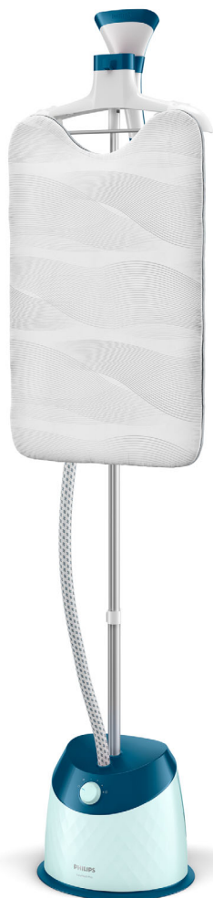
Philips EasyTouch Plus Garment Steamer