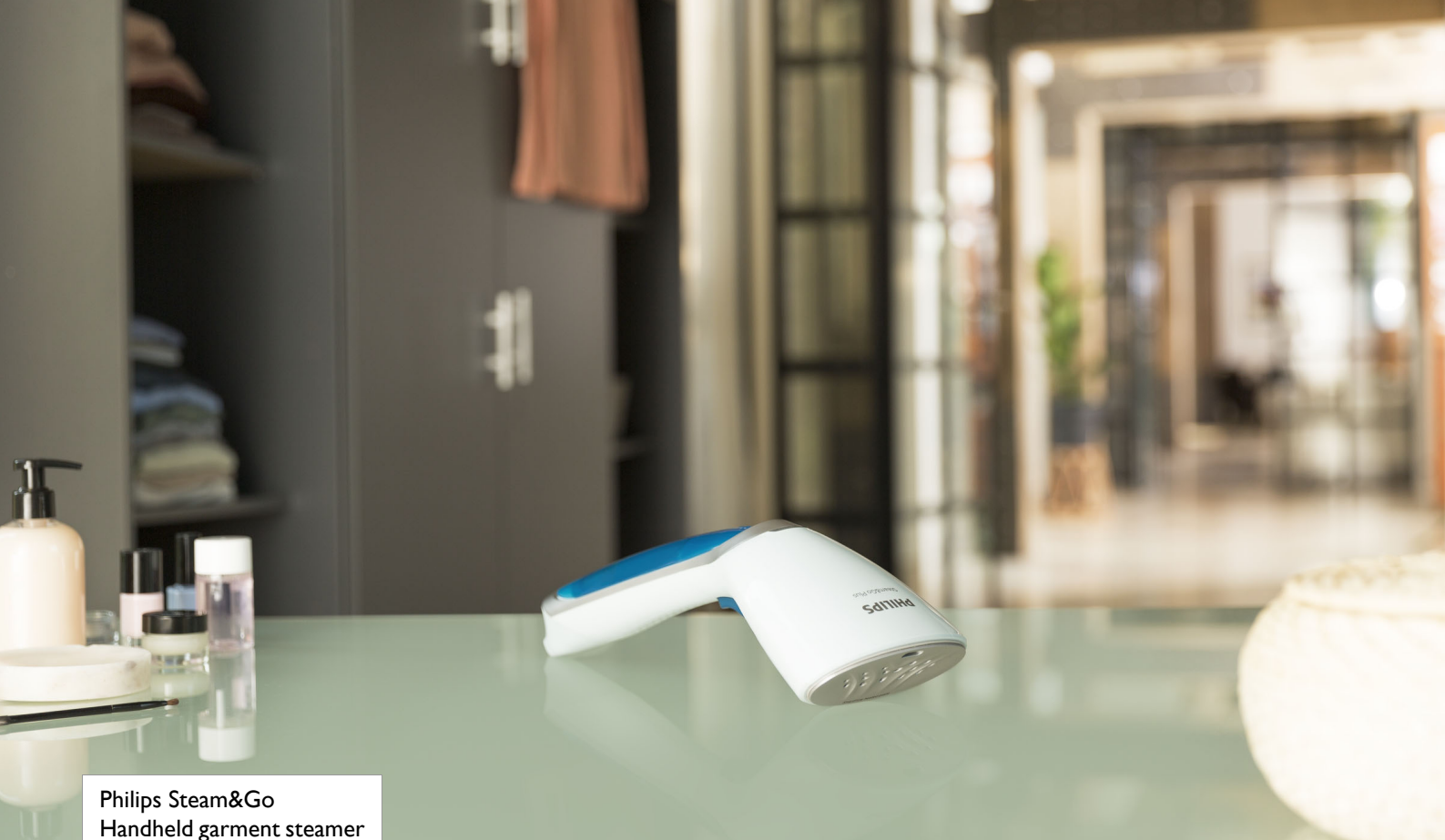
Philips Steam&Go Handheld garment steamer