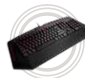
Lenovo Y Gaming Mechanical Switch Keyboard