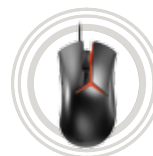
Lenovo Y Gaming Optical Mouse