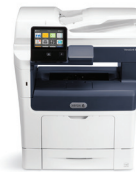
Xerox® VersaLink B405 Multifunction Printer