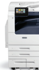
Xerox® VersaLink B7025/B7030/ B7035 Multifunction Printer