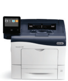
Xerox® VersaLink® C400 Color Printer