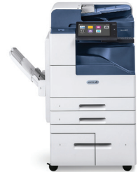
Xerox® AltaLink B8045/8055/8065/ 8075/8090 Multifunction Printer

To learn more about Xerox® ConnectKey Technology, go to www.connectkey.com .