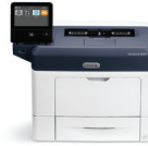
Xerox® VersaLink B400 Printer