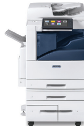
Xerox® AltaLink C8030/C8035/ C8045/C8055/ C8070 Color Multifunction Printer