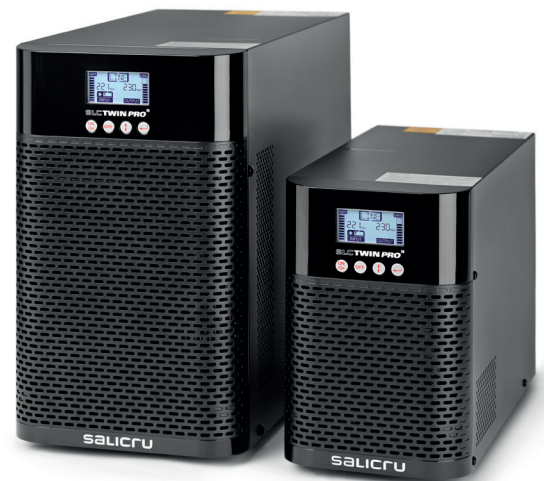
SLC TWIN PRO2