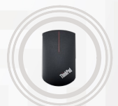
ThinkPad Precision Wireless Mouse