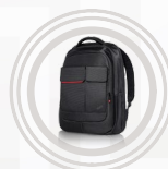
ThinkPad Professional Backpack