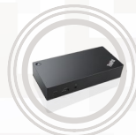
ThinkPad ThunderBolt Dock