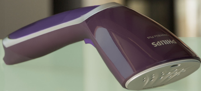
Philips Steam&Go Handheld garment steamer