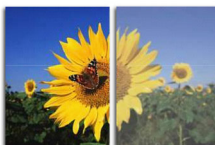
With SmartImage Without SmartImage

SmartImage is an exclusive leading edge Philips technology that analyzes the content displayed on your screen and gives you optimized display performance. This user friendly interface allows you to select various modes like Office, Image, Entertainment, Economy etc., to fit the application in use. Based on the selection, SmartImage dynamically optimizes the contrast, color saturation and sharpness of images and videos for ultimate display performance. The Economy mode option offers you major power savings. All in real time with the press of a single button!