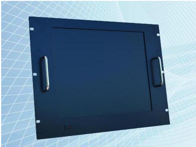
FRONT VIEW ▲