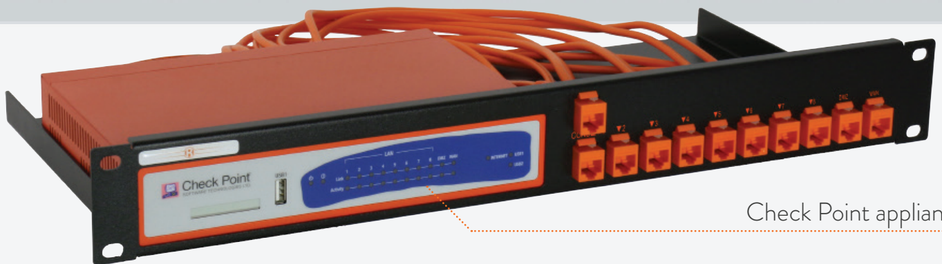
Check Point appliance