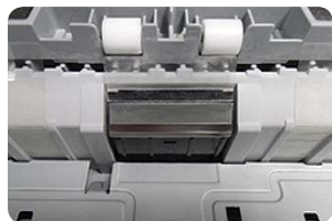
Conventional friction pad