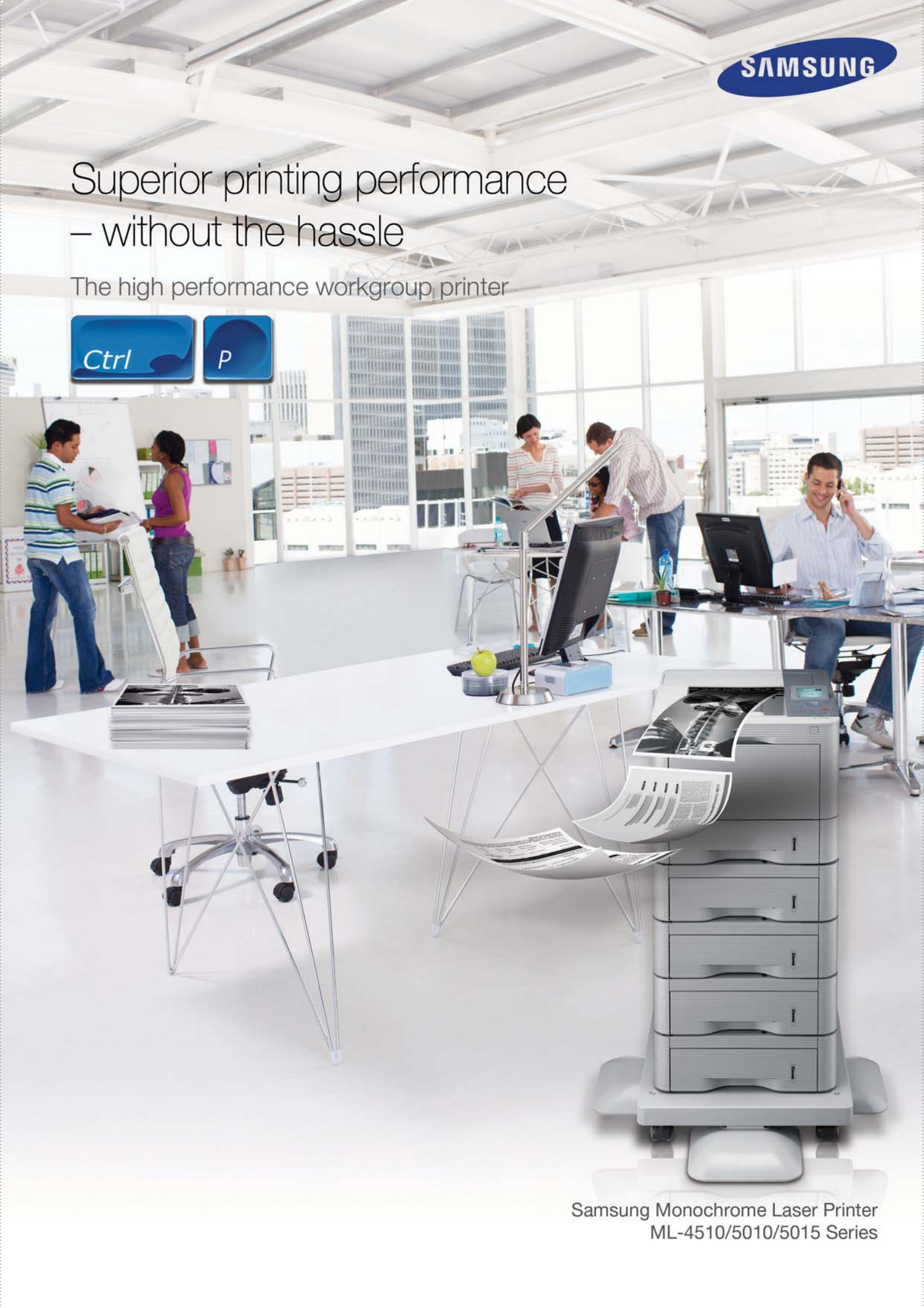
Samsung Monochrome Laser Printer ML-4510/5010/5015 Series