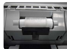
Samsung semi-retard roller

Print interruptions are a distant memory with Samsung's Anti-Jam Technology. The Samsung CLP-775ND uses improved paper feed technology to prevent unwanted incidents such as multiple page paper pickups, misfeeds and paper jams from occurring.