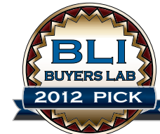
CLP-775ND Outstanding A4 Color Printer for Small/Mid-size Workgroups