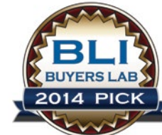
Xpress C1860 Outstanding Personal Color MFP