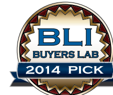
ProXpress M3370 Outstanding A4 Monochrome MFP for Small Workgroups

Product Support http://www.hp.com/go/Samsung