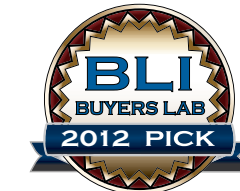
CLP-775ND Outstanding A4 Color Printer for Small/Mid-size Workgroups