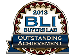
NFC Summer 2013 Outstanding Achievement in Innovation