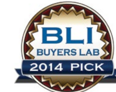
Xpress C1860 Outstanding Personal Color MFP