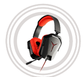
Y Gaming Stereo Headset

* Example of Lenovo Legion catalogue naming convention