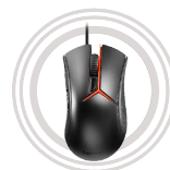
Y Gaming Optical Mouse