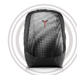
Y Gaming Armored Backpack