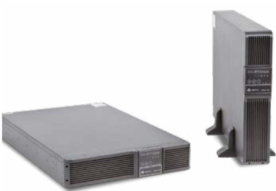
Liebert PSI 2U Rack version