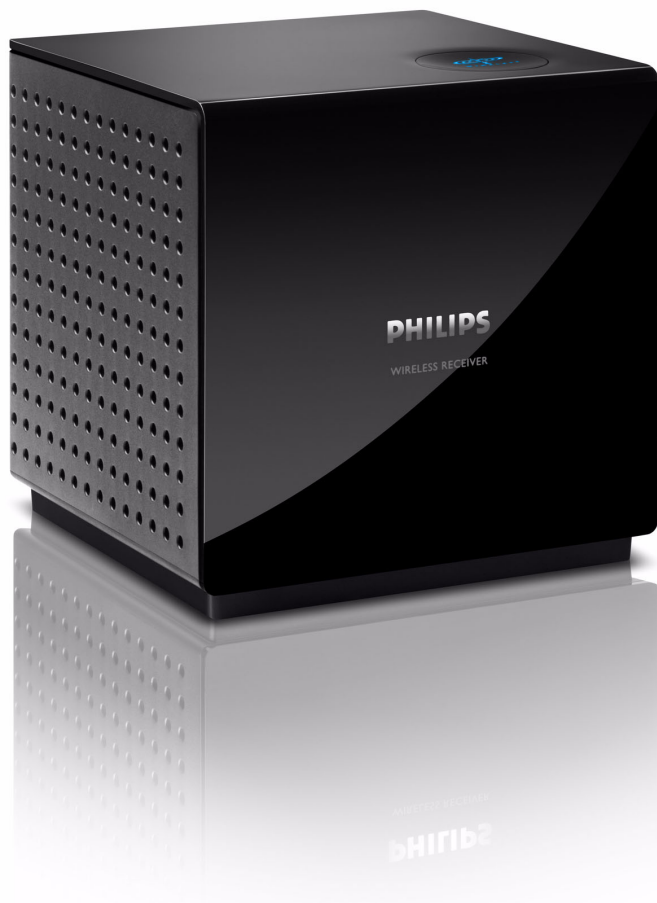
Philips Wireless Rear Audio module