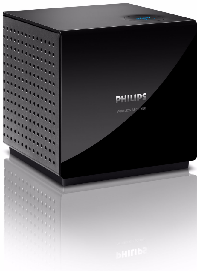
Philips Wireless Rear Audio module