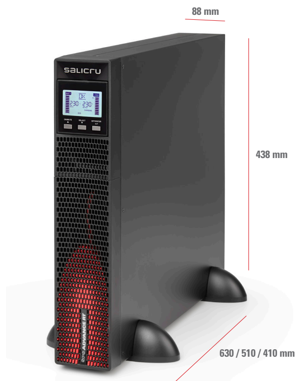
SPS 800÷3000 ADV RT2