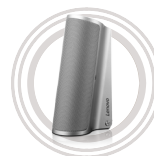
Lenovo™ 500 Bluetooth® Speaker