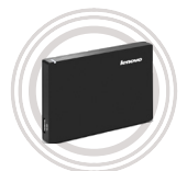
Lenovo™ UHD F308 1 TB