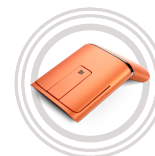
Lenovo™ N700 Wireless Mouse