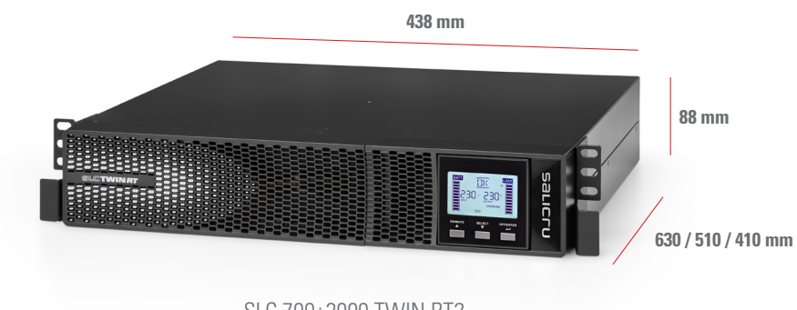
SLC 700÷3000 TWIN RT2