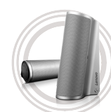
Lenovo 500 2.0 Bluetooth® Speaker