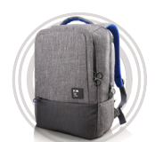
Lenovo 15.6" NAVA On-trend Backpack