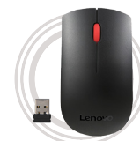
Lenovo 510 Wireless Mouse