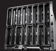
EXTREME SCALE INFRASTRUCTURE