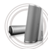
Lenovo 500 2.0 Bluetooth® Speaker