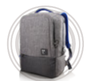
Lenovo 15.6" NAVA On-trend Backpack