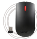
Lenovo 510 Wireless Mouse