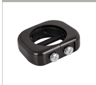
Ø60mm Accessory Collar Mounts AV accessories such as component shelves onto poles