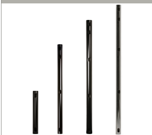
Ø60mm Poles Lengths available: 0.5m, 1.1m, 1.5m & 2m