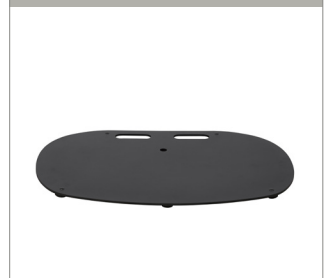
Medium Floor Base For use with Ø60mm poles

© 2016 B-Tech Professional Design & Manufacturing Ltd. All rights reserved. The information in this specification sheet reflects the current technical specifications at the time of print. We reserve the right to change the technical or physical specifications without prior notice. This B-Tech Professional Design & Manufacturing Ltd. B-Tech Professional Design & Manufacturing Ltd. is not responsible for loss or damage caused by improper installation or use of the product. Any reproduction or transmission or replication of any part of this specification is expressly prohibited unless prior written permission has been granted by B-Tech Professional Design & Manufacturing Ltd. (B-Tech). SS-V1.1-BT4002-150219