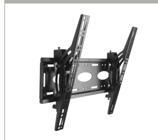
Flat Screen Interface Kit Suitable for pole mounting using accessory collars