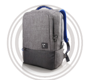
Lenovo 15.6" NAVA On-Trend Backpack