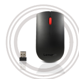
Lenovo 510 Wireless Mouse