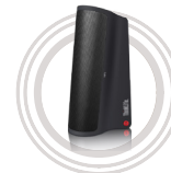
Lenovo 500 2.0 Bluetooth® Speaker