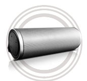
Lenovo 500 2.0 Bluetooth® Speaker