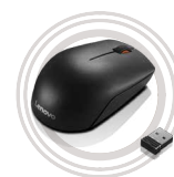
Lenovo 300 Wireless Compact Mouse