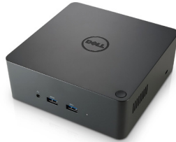
Dell Thunderbolt™ Dock | TB16