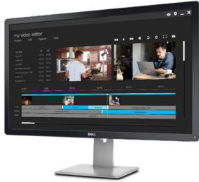
Dell UltraSharp Ultra HD 4K Monitor with PremierColor | UP3216Q