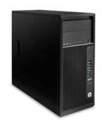
Agency Performance Desktop (A-PDT) HP Z240 Tower Workstation