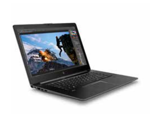
Agency Mobile Workstation (A-MWS) HP ZBook 15 G4 Mobile Workstation