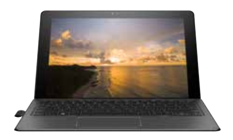
Network Slate Tablet (NST) HP Pro x2 612 G2 Tablet