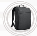
Lenovo Casual Backpack B200