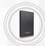
Lenovo UHD F309 1TB Portable Secure Hard Drive