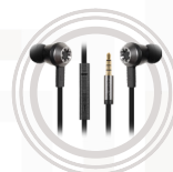
Lenovo 500 Extra Bass In-Ear Headphone