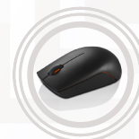
Lenovo 300 Wireless Compact Mouse