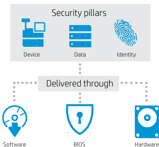
Figure 1. HP Client Security delivers end-to-end protection at all levels of the business IT environment.

Our client security strategy includes creating multiple layers of protection across devices, data, and identity. Along with delivering HP security tools through software, such as HP Client Security and HP Sure Start, we provide additional features in hardware and embed strong protections all the way down to the BIOS level. IT managers can centrally configure, deploy, and update these tools without interrupting employee productivity.