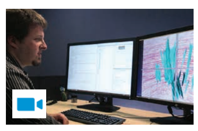
Click image to view CGG video