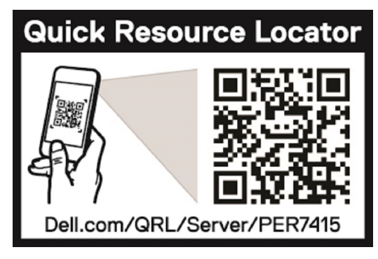
Figure 2. Quick Resource Locator for PowerEdge R7415