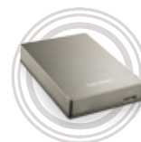
Lenovo UHD F309 USB 3.0 2 TB