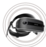
Lenovo Zone VR Headset*