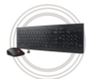
Lenovo 510 Wireless Combo Keyboard & Mouse

* Lenovo Zone will be available starting October 2017.