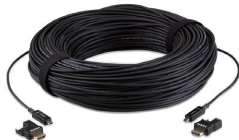
VE7834 / VE7835