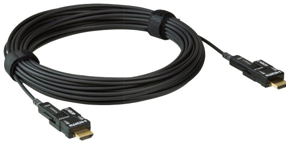
VE7832 / VE7833