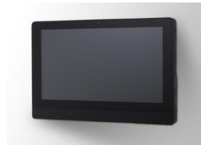
VESA Wall-Mounted *)