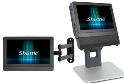
VESA Arm / VESA Stand *)