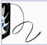
40cm Temperature Sensor Cable