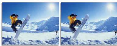
2ms GtG response time > 2ms GtG response time

Turbo modes turns on over drive circuit for best response time, reduce jaggy edges for fast moving objects on screen, enhance contrast ratio for bright and dark scheme, this profile delivers the best gaming and movie experience.