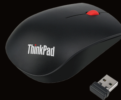
◀ ThinkPad Essential Wireless Mouse