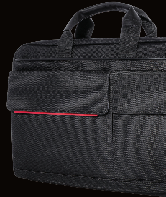
Lenovo Professional ▶ Topload Case