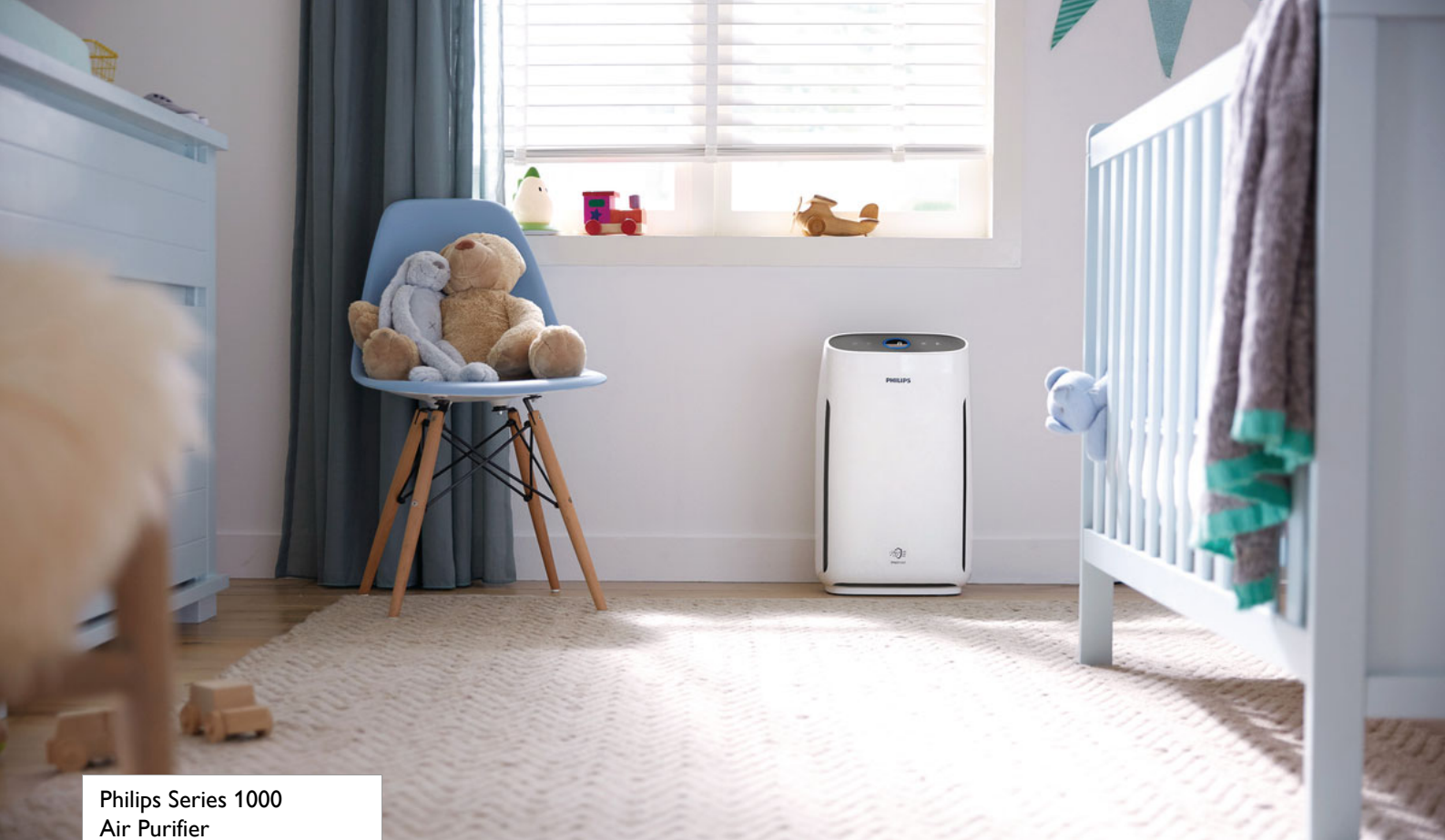
Philips Series 1000 Air Purifier