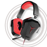
Lenovo Y Gaming Stereo Headset