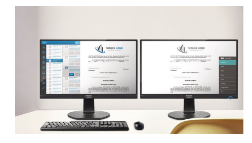
EasyRead mode for a paper-like reading experience