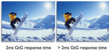
2ms GtG response time > 2ms GtG response time

SmartResponse is a exclusive Philips overdrive technology that when turned on, automatically adjusts response times to specific application requirements like gaming and movies which require faster response times in order to produce judder, time-lag and ghost image free images