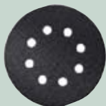
Removing material K 40/60