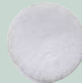
Lambswool bonnet 2 609 256 049