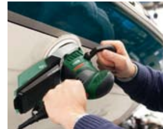
Powerful for polishing