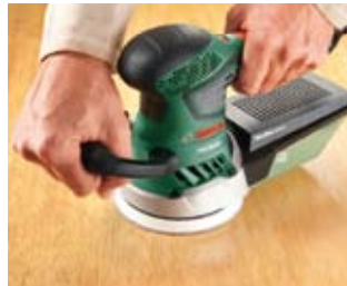
Delicate for preparing and finishing