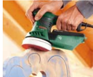
Flexible for curved surfaces