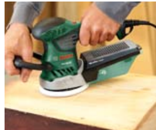
Flexible for curved surfaces