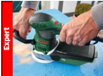
Particularly powerful for sanding off paint