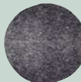
Polishing felt 2 609 256 054