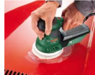
Powerful for polishing