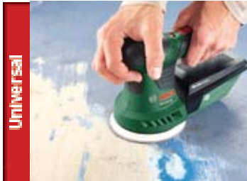
Powerful for sanding off paint