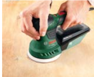
Delicate for preparing and finishing