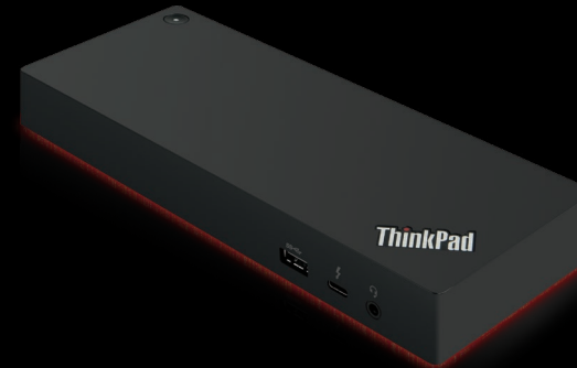
◀ ThinkPad® Thunderbolt™ Workstation Dock