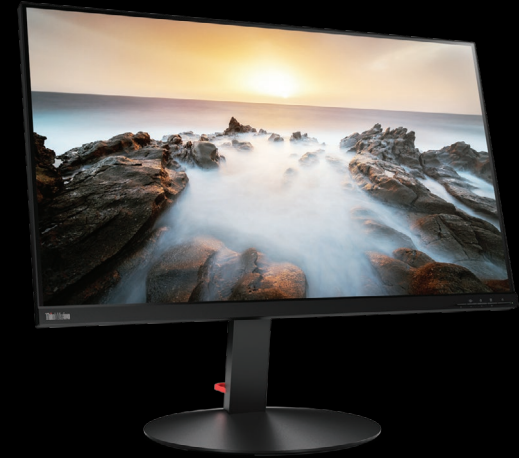
ThinkVision® P32u ▶ Monitor