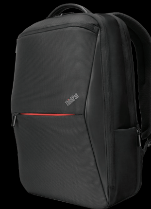
ThinkPad® Professional ▶ 15.6" Backpack